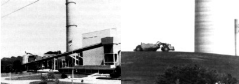
Views of the Tennessee Valley Authority's Bull Run and Kingston Steam Plants. These coal-fired facilities generate electricity for Oak Ridge and the surrounding area.

An average value for the thermal energy of coal is approximately 6150 kilowatt-hours(kWh)/ton. Thus, the expected cumulative thermal energy release from U.S. coal combustion over this period totals about 6.87 \times 10^{14} kilowatt-hours. The thermal energy released in nuclear fission produces about 2 \times 10^9 kWh/ton. Consequently, the thermal energy from fission of uranium-235 released in coal combustion amounts to 2.1 \times 10^{12} kWh. If uranium-238 is bred to plutonium-239, using these data and assuming a "use factor" of 10%, the thermal energy from fission of this isotope alone constitutes about 2.9 \times 10^{14} kWh, or about half the anticipated energy of all the utility coal burned in this country through the year 2040. If the thorium-232 is bred to uranium-233 and fissioned with a similar "use factor", the thermal energy capacity of this isotope is approximately 7.2 \times 10^{14} kWh, or 105% of the thermal energy released from U.S. coal combustion for a century. Assuming 10% usage, the total of the thermal energy capacities from each of these three fissionable isotopes is about 10.1 \times 10^{14} kWh, 1.5 times more than the total from coal. World combustion of coal has the same ratio, similarly indicating that coal combustion wastes more energy than it produces.